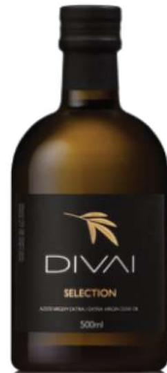
Selection Extra-Virgin Cobrançosa, Arbequina, Galega