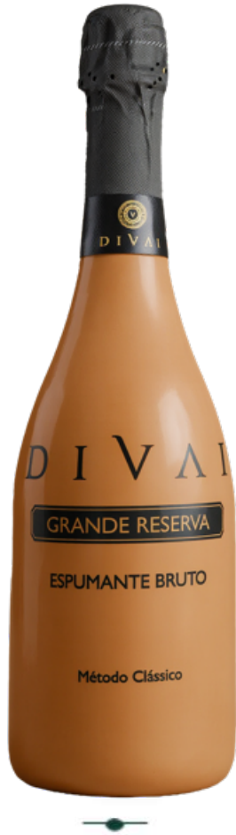
Grande Reserva Sparkling Wine, Bical, Maria-Gomes, Chardonnay and Arinto