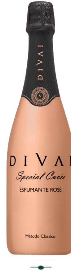
Rosé Sparkling Wine Baga