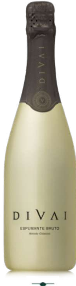
Brut Sparkling Wine Arinto, Bical, Chardonnay, Baga