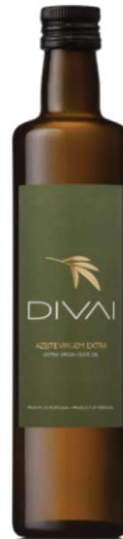
Extra Virgin Arbequina, Cobrançosa, Picual